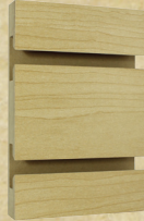
Hard Rock Maple