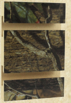
Mossy Oak® Break- Up Infinity®

Optional: Aluminum and plastic inserts available