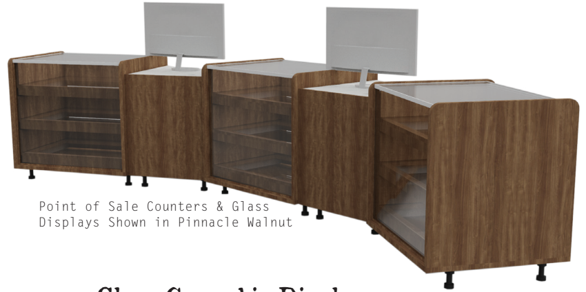
Point of Sale Counters & Glass Displays Shown in Pinnacle Walnut