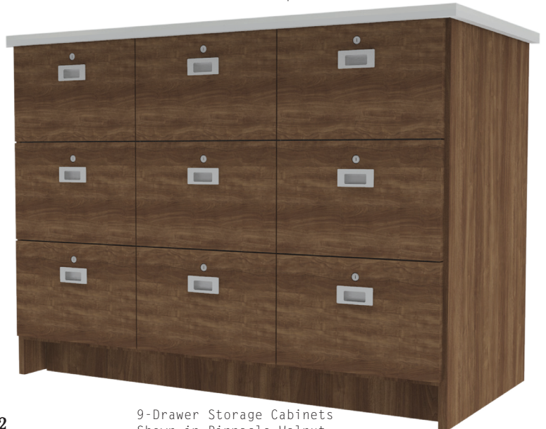
9-Drawer Storage Cabinets Shown in Pinnacle Walnut